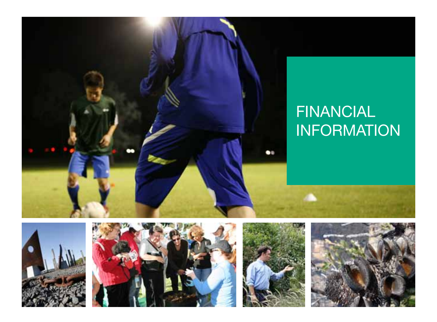
A complete copy of Council's Annual Financial Reports are available on Council's website at www.canadabay.nsw.gov.au.